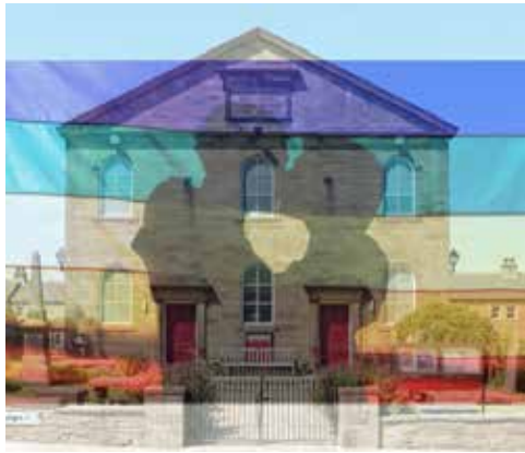
West Lane Baptist Church...where all are welcome and none are turned away!